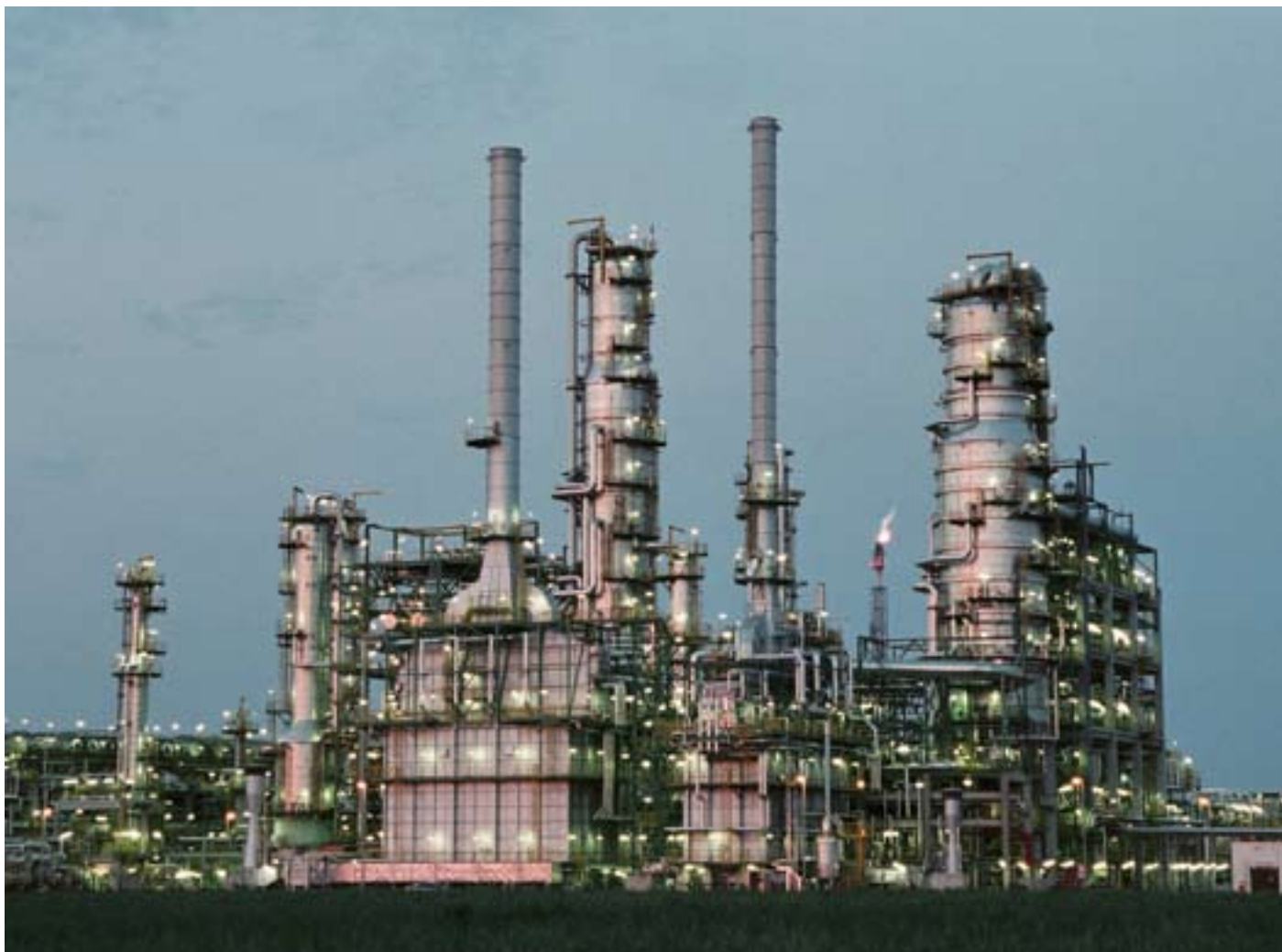
Chemical production plant

In a number of cases BAFA takes such a decision only after political consultations with the Federal Ministry of Economics and Technology and the Federal Foreign Office. The granting of a licence also depends on the exporter's reliability. In this context, BAFA may request the nomination of a person responsible for exports on the level of the management.