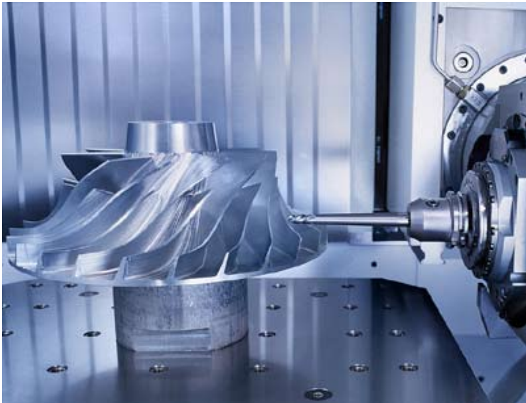
A DMU 160 FD duo BLOCK turning and milling an impeller for an aircraft power unit

BAFA regularly sends its experts to the meetings of the control bodies and the EU-working groups.