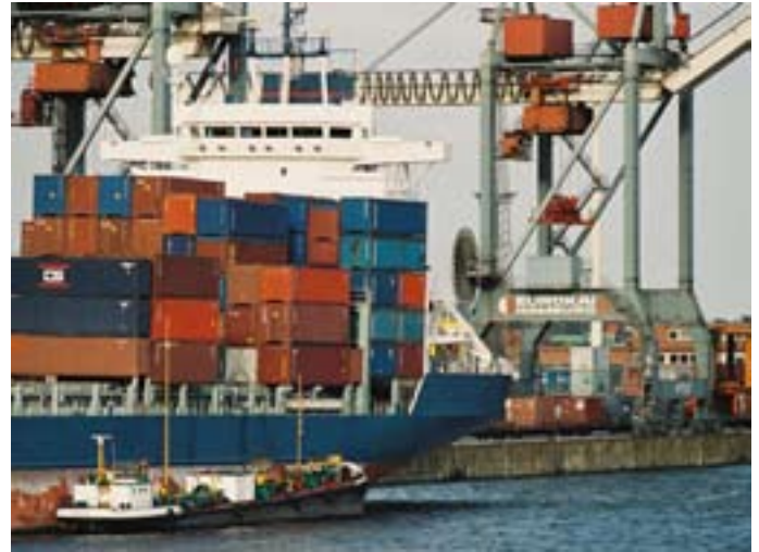
Container Ship / Port of Hamburg

In co-operation with the authorities of the countries of origin, the European Commission and the German customs offices, BAFA's Division dealing with "Circumvention Imports" in the Textile Sector examines presumed breaches of non-preferential import rules in the field of textiles, clothing and steel.