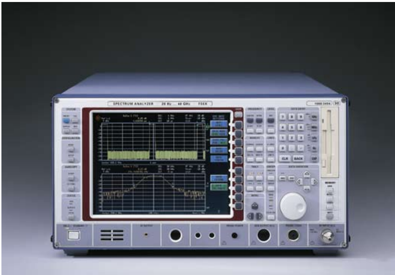
Dual-use item: Spectrum analyzer

Important laws and latest announcements and information are available at: www.ausfuhrkontrolle.info .